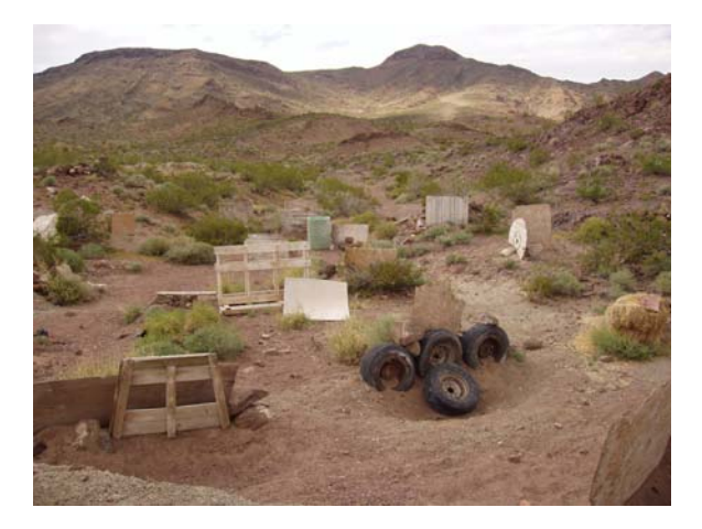
Illegal paintball course (Northeast portion of the NCA)

potential decisions and helps ensure that an effective anti-litter message is delivered.