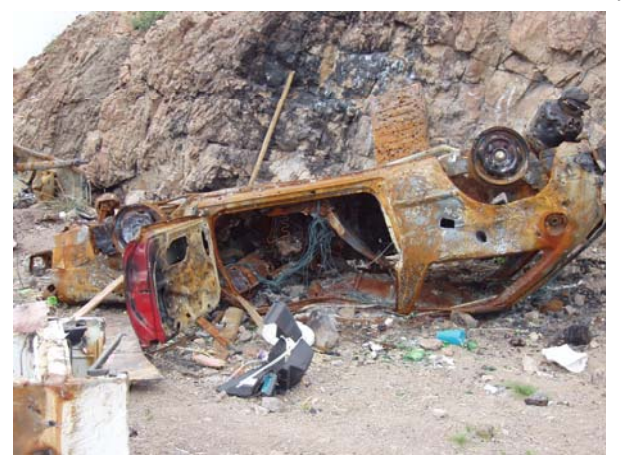
Northeast portion of the NCA depicting illegal disposal of automobile

48,438 acres that encompass a diverse landscape, ranging from the North McCullough Wilderness (Wilderness) to borders with densely populated urban areas. The Sloan Canyon NCA Act (Title VI of the Clark County Conservation of Public Land and Natural Resources Act of 2002), which established the NCA, requires the Bureau of Land Management (BLM) to develop a management plan for the NCA, including a plan for litter cleanup and a public lands awareness campaign around the in and Conservation Area. Incorporating this Litter Cleanup Plan and Public Lands Awareness Campaign into the Approved Resource Management Plan provides adaptability and efficiency in implementing cleanup actions by identifying management priorities and related